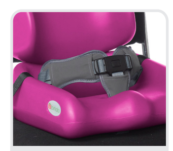
3-point pelvic harness helps to safely secure the hips