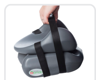
Straps together for easy carrying and storage