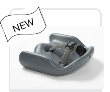
New Hip-Flex Seat Liner for use with reclining seating systems

Use size 1 and 2 Liners with Jogger (Sold Separately)